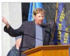
Veterans Day 2012 (16 photos)

Click Here to order dotphoto Photo Reprints